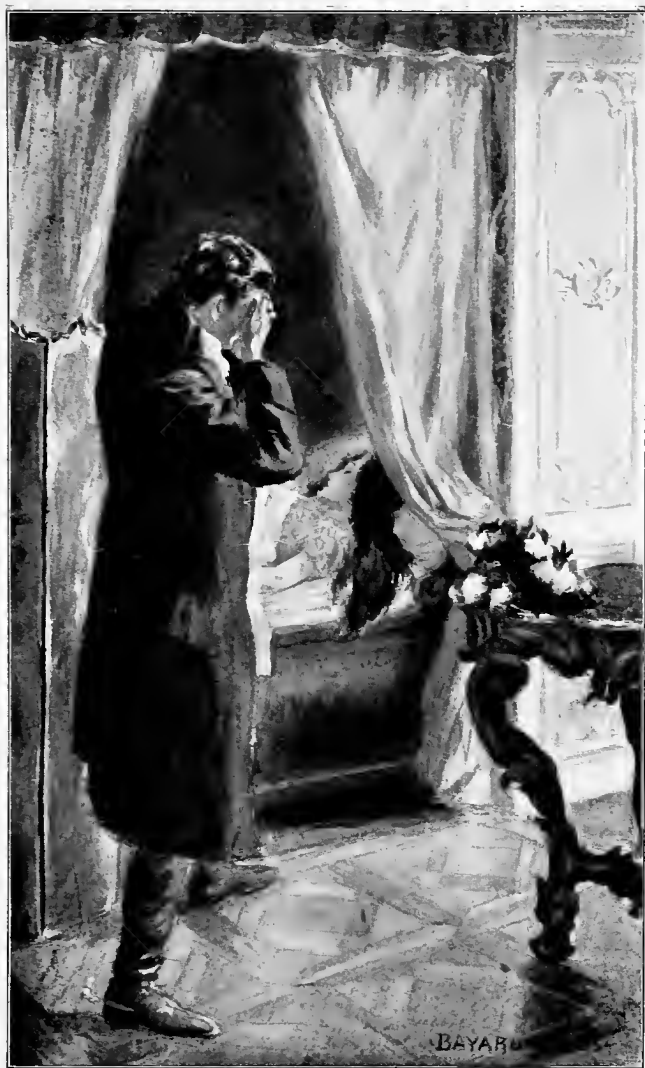
He recoiled with a heart-broken cry.